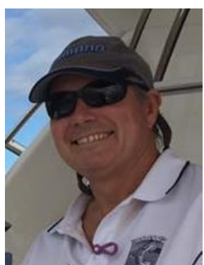
Jon Eagle Recorder