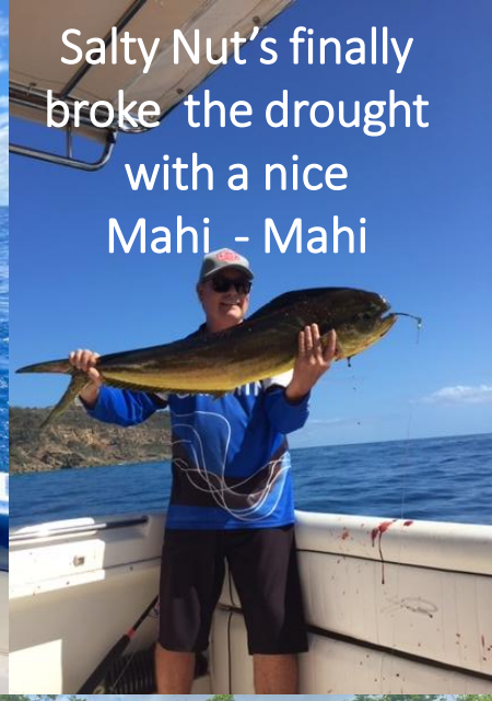
Salty Nut's finally broke the drought with a nice Mahi - Mahi