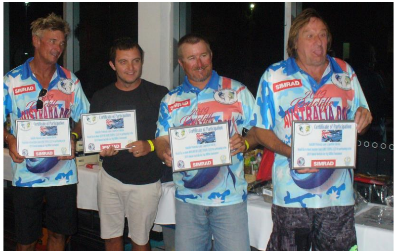
Representatives from other clubs who fished the Australia Day Billfish Tournament