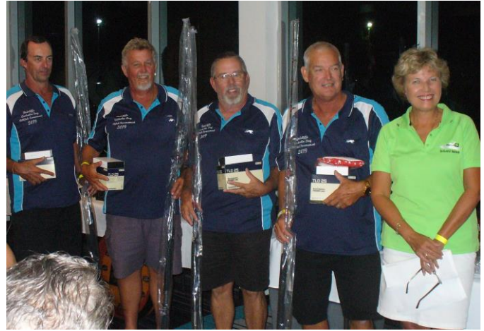
Champion Boat under 7m - Life's Great