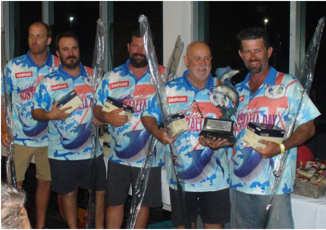
Champion Boat over 7m –Release