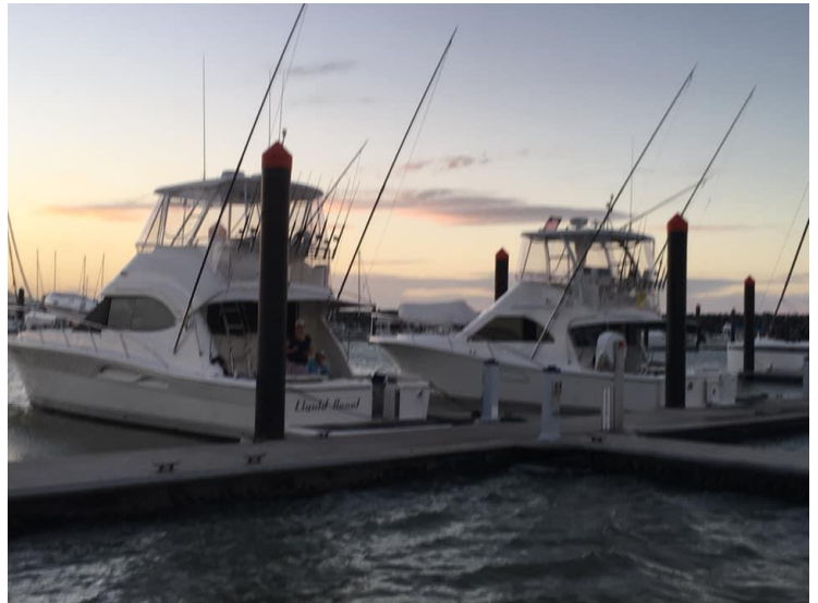
Liquid Asset & Over It in for a very windy night at the marina at Rosslyn Bay.