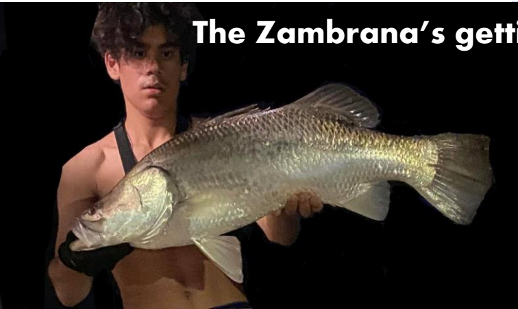
The Zambrana's getting in on some action