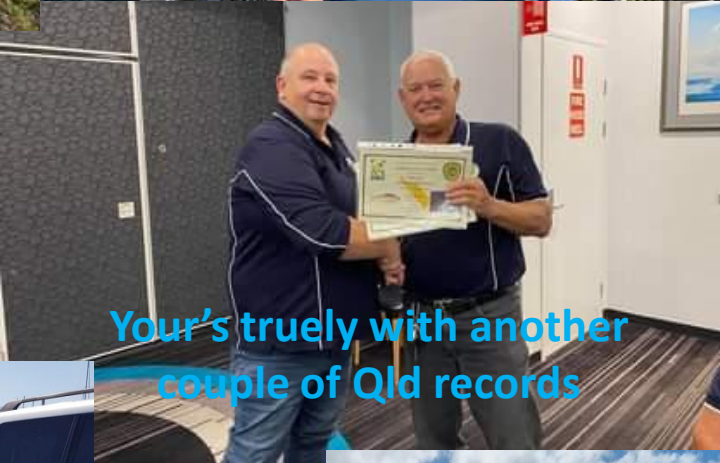
Your's truly with another couple of Qld records