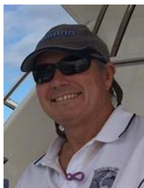
Jon Eagle Recorder