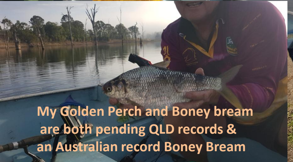
My Golden Perch and Boney bream are both pending QLD records & an Australian record Boney Bream